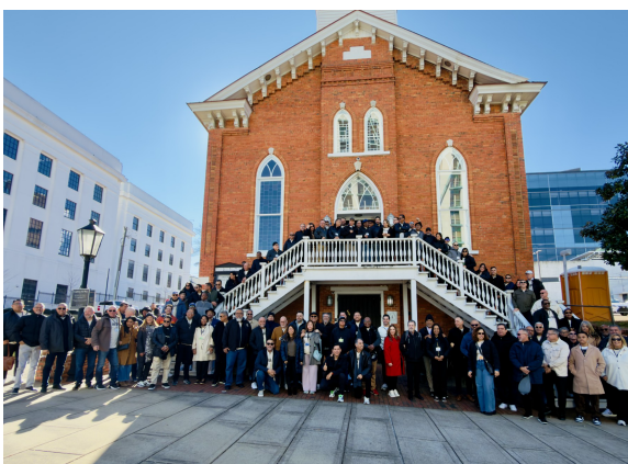
Group of Hispanic leaders in front of Dexter Avenue King Memorial Baptist Church in Montgomery, Alabama, where Dr. Martin Luther King pastored from 1954-1960.