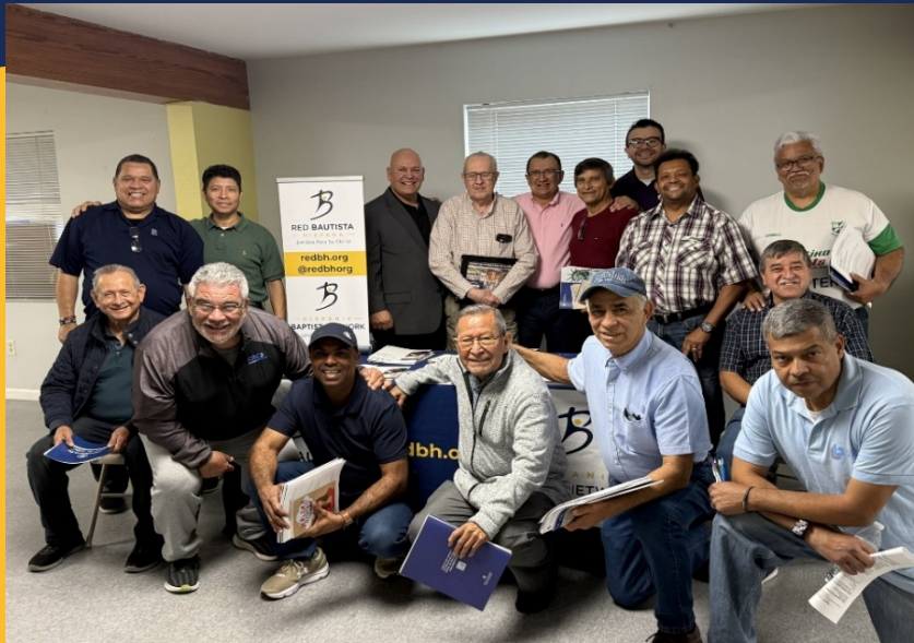
←Pastors from the New Orleans Hispanic Baptist Association

The Hispanic Baptist Network is a 501(c)(3) organization, composed of: